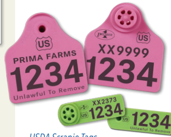
USDA Scrapie Tags