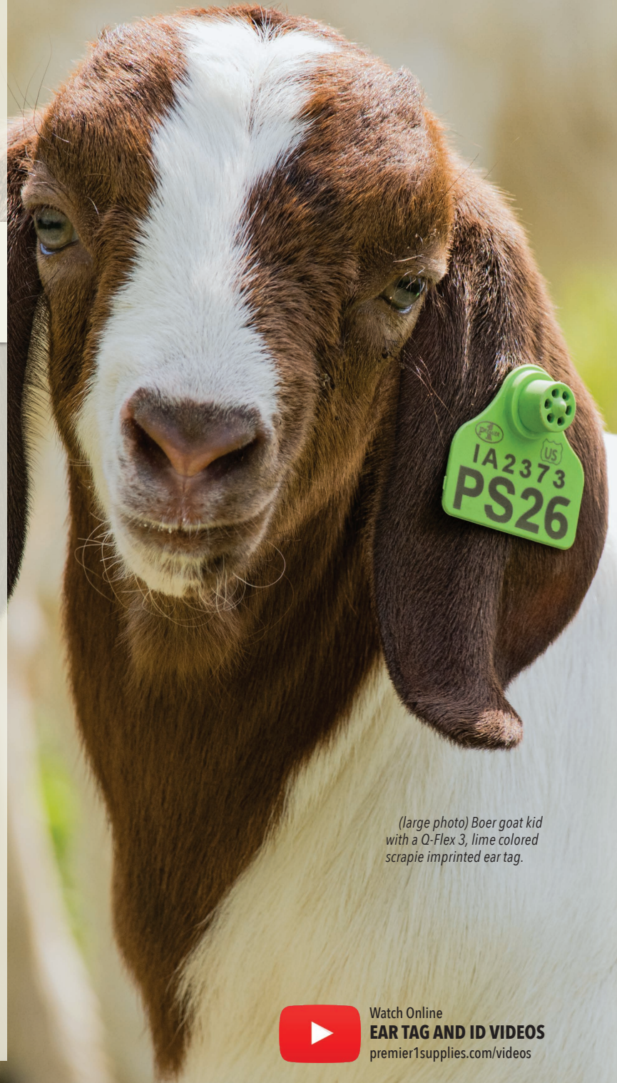
(large photo) Boer goat kid with a Q-Flex 3, lime colored scrapie imprinted ear tag.

How are we able to do this? Most tag sales occur during Premier's "slow" months—so we price the tags accordingly because our staff has more time then. It's a win for us and for you.