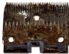
Example of severe rust