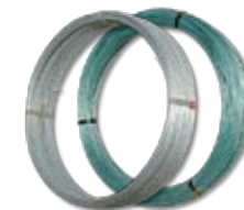
Q. & R. Smooth Wire