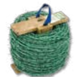
S. Barbed Wire