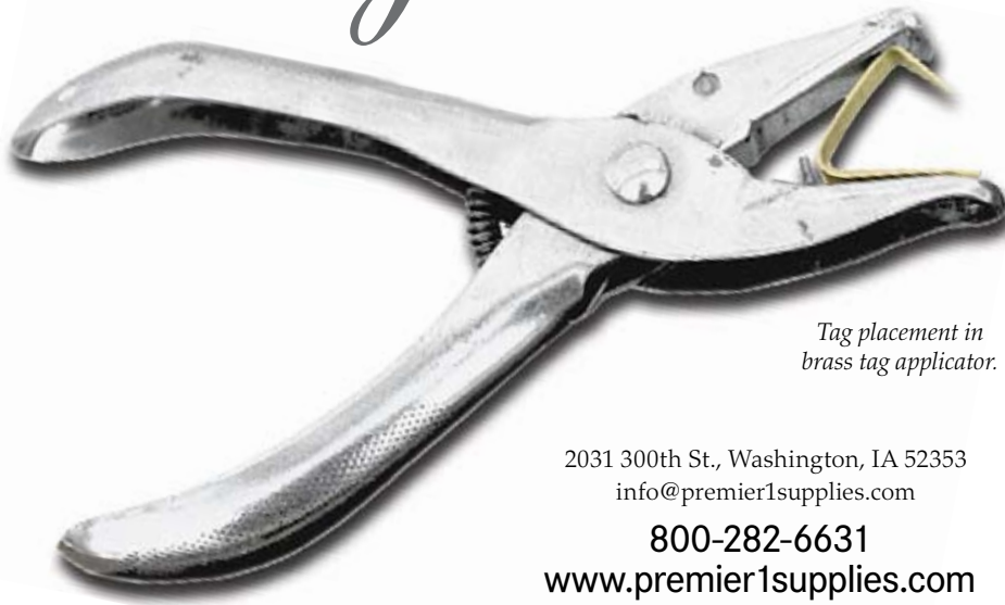
Tag placement in brass tag applicator.