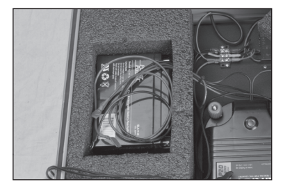
5. Place battery back into the foam pocket. The wires should be on top of the battery.