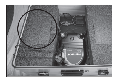
1. Looking at the inside of the PRS unit as in the picture, remove the left foam battery cover and set aside.