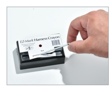
1. If using metal cotter pin, remove from the packaging. The plastic pins are provided loose.