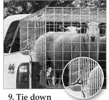
appropriately (tie downs not included).

For the small pick up hauler, the 2 C panels are one panel instead of two. Assembly is the same for both.