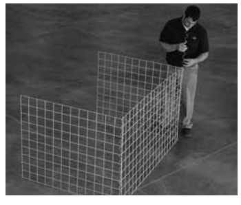
2. Connect the second B panel to the A panel, use a 40" hinge.