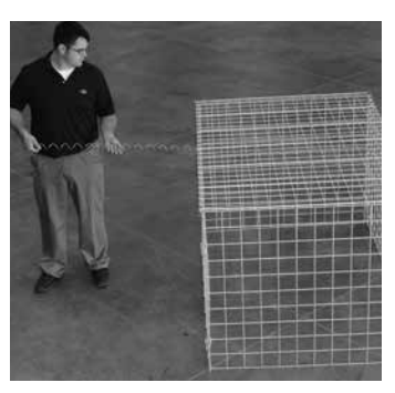
7. Connect the 48" sides of the C panel with the 48" hinge.