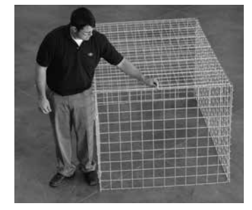
8. Connect the C panel to B panel (door) with remaining snap clip.