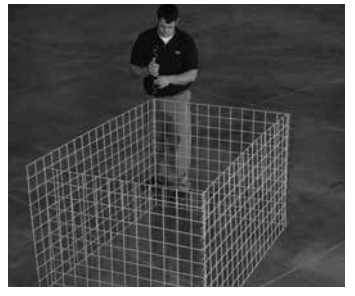
3. Connect the second A panel to one of the B panels with a 40" hinge. Use two snap clips to connect the remaining corner.