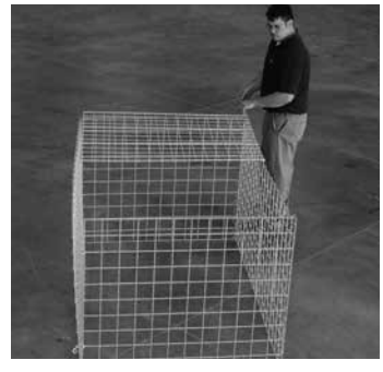
4. Place panel C onto the top of the rear side of the hauler frame. Connect 36" sides to the A panel with 36" hinges.