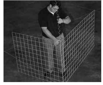
1. Connect panel B to panel A with a 40" connector hinge.