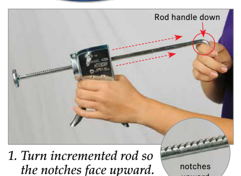
2. Twist and lock tube into place.

www.premier1supplies.com • 800-282-6631 • Washington, IA