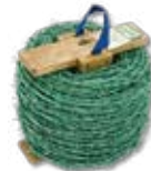
A. Barbed Wire

Skill: Moderate. It's hard work; the barbs force respect and caution.