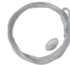
D. Speed Brace