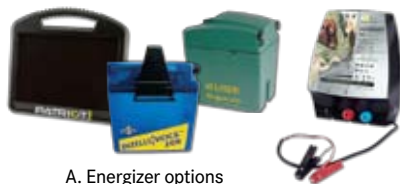
A. Energizer options