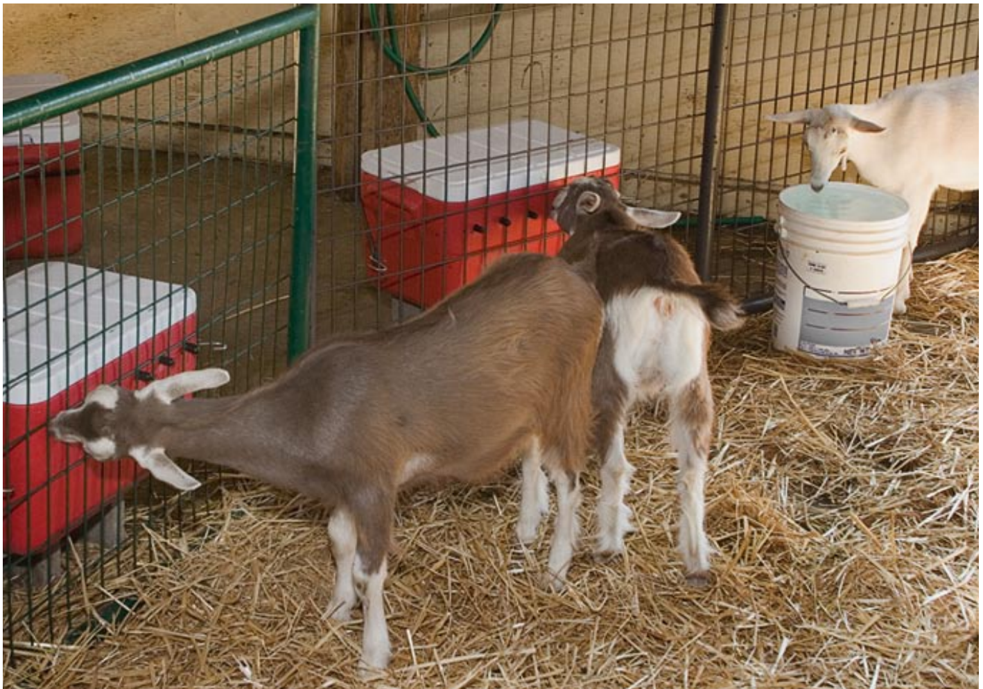
Cooler lamb-bars; the milk is kept cool all day and the kids can self-feed.