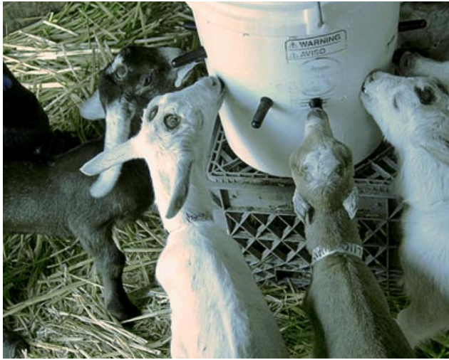
The lamb-bar; standard industry practice.