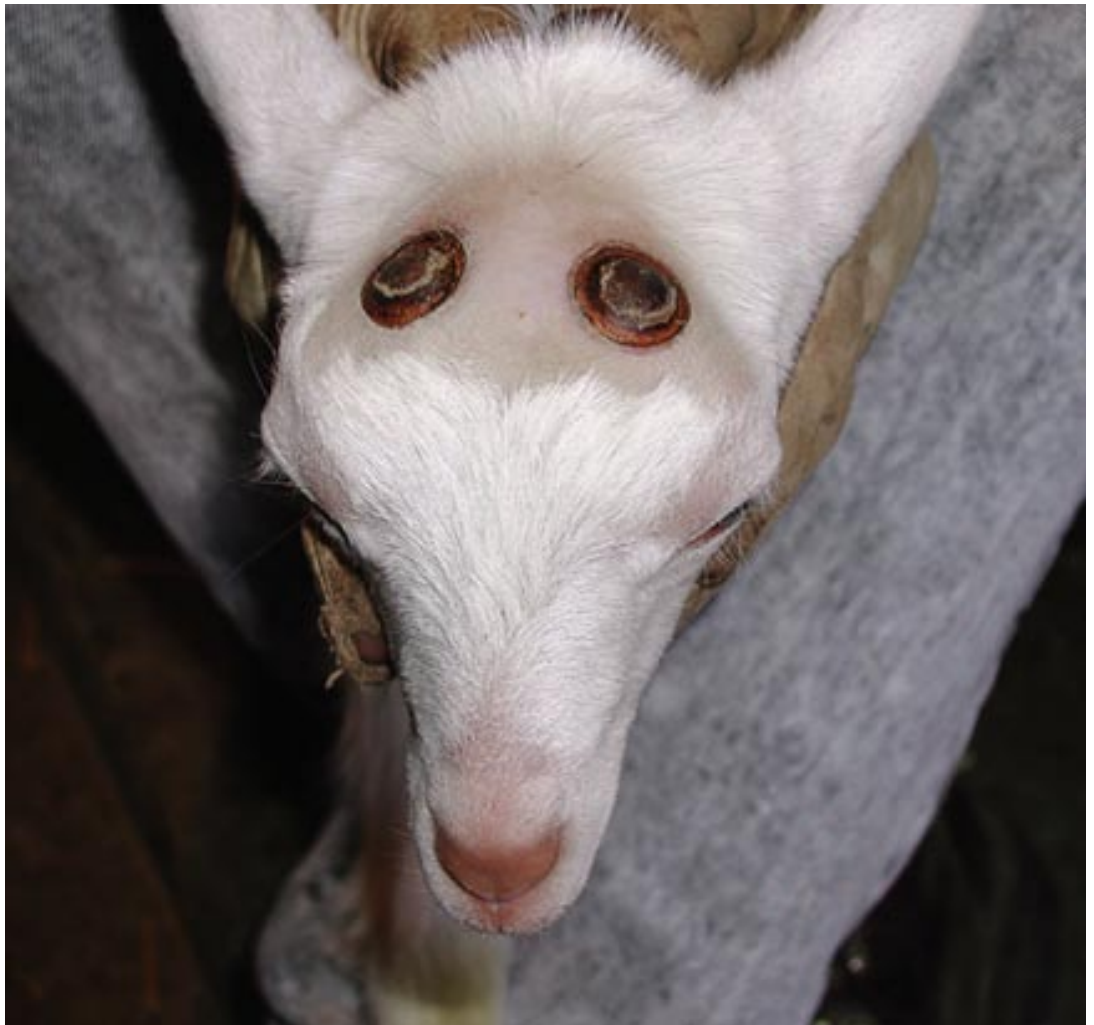
After application of the disbudding iron, but prior to removal of the horn bud caps. The outer ring, which should be no smaller, will be copper in color.

Breeders who have not already vaccinated their kids against tetanus will usually give each kid a preventative tetanus antitoxin injection prior to disbudding. Start burning when the tip of the iron is red-hot. How long you burn will depend on the strength of the iron and the size of the horn bud. Weaker irons may take as long as 20 seconds while stronger irons may take as little as 6 seconds. The only consistent rule of thumb is that you must apply the iron until you see a dry, copper-colored ring around the horn bud. You can also flip the tip off of the horn bud with the iron as it weakens as you burn around it.