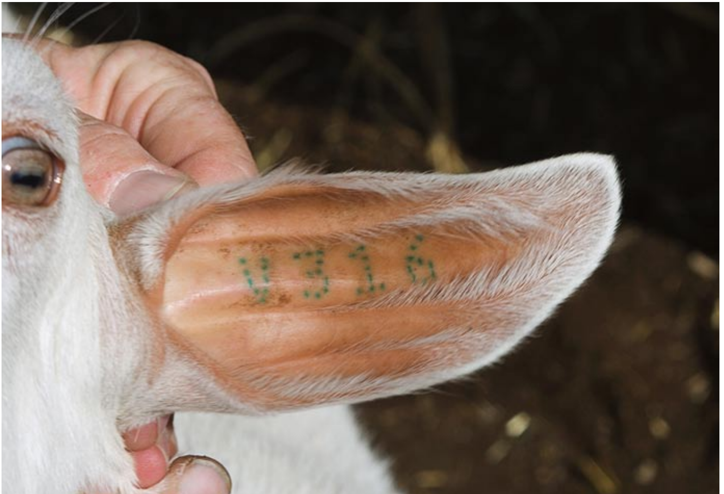
A well-done ear tattoo remains legible for the life of the goat. An illegible tattoo will create difficulties with herd records.

Kids may need to have their hooves trimmed as early as two months of age. To determine when you need to start trimming, examine the hoof for long edges around the perimeter of the hoof or heel, either of which may fold inward. Keeping the hooves trimmed is a healthy practice and can prevent serious foot problems such as hoof rot and abscesses. The goat's foot bones can be thrown out of line, causing lameness, if the hooves are not properly cared for.