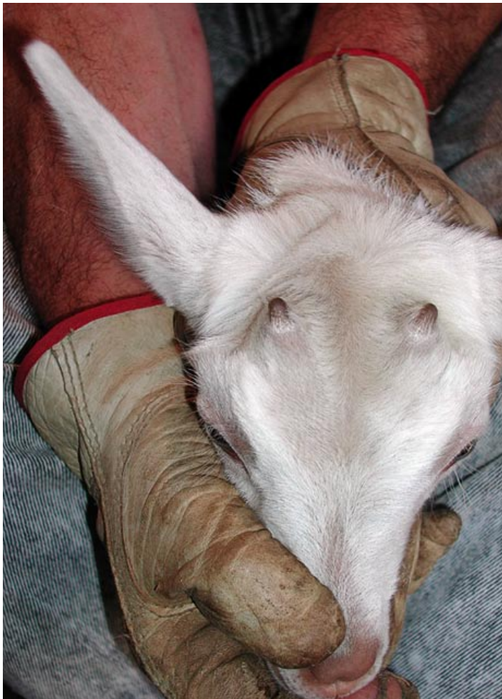
This kid's horn buds are too large and should have been removed sooner with a disbudding iron to avoid scurs (horn regrowth).

Disbudding, depending on goat breed and gender, could be needed as early as a few days of age, or whenever you can clearly feel the horn buds. Hair growth over the horn bud should be palpated (i.e., felt by hand) so you can avoid trying to disbud a naturally polled (i.e., hornless—which is generally rare) kid. The hair on the horn bud will grow in a swirl over the horn bud, whereas the hair on a polled kid will grow flat over the horn area. Most importantly, you will need an effective way to restrain the kid during the process. Remember, you are working with a hot iron and any movement by the kid will create a greater hazard to you, the kid, and anyone else who is helping you. The common restraint tool is a kid disbudding box, available through livestock supply catalogs. This box completely encloses the kid, with the exception of the head, and allows one person to do the disbudding unassisted. Several brands of electric iron are available through most supply catalogs and their effectiveness does not vary to any great extent, although a hotter iron may be more desirable as it reduces disbudding time. Most sources recommend an iron with a \frac{3}{4} - to 1-inch diameter tip. Shaving the horn bud before you start will provide you with a better view of what you are doing and will also lessen the smell from burnt hair.