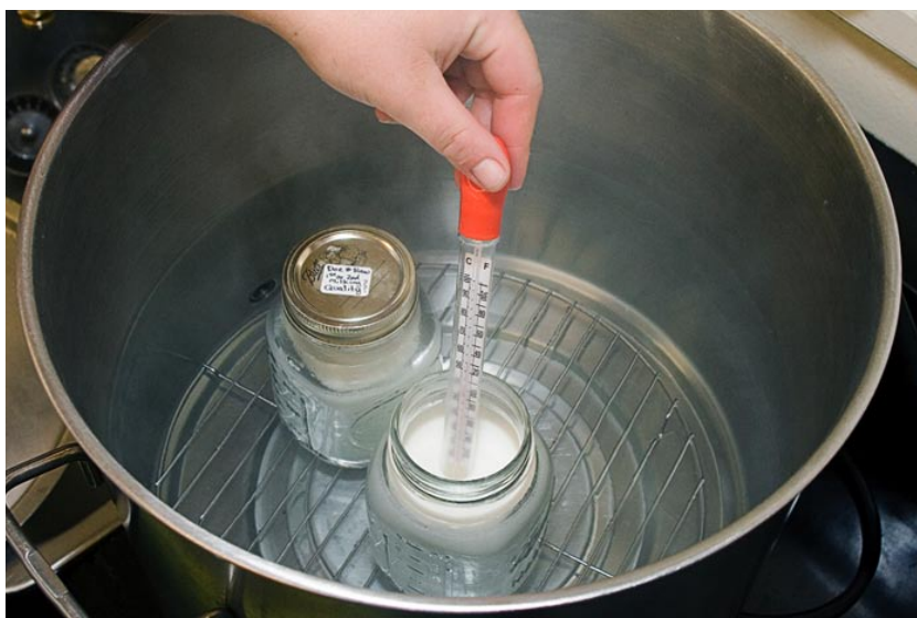
A hot water bath prevents scorching as it maintains an even temperature for the 60-minute heat-treatment period for colostrum.

Colostrum provides the kid with an extremely high-nutrient diet that stimulates both its metabolism and its digestive activities. Colostrum tends to be much higher in protein, vitamins, and minerals than regular milk, and so gives the kid a jump-start at a time when it has low amounts of these essential nutrients. When it is first born, the kid has very little immunity to the pathogens it will encounter in the environment. Instead, it depends on passive immunity from the antibodies received in colostrum to fight diseases. At the UC Davis Dairy Goat Facility, all colostrum is heat-treated before being fed to the kids in order to minimize the instance of CAE in the herd as well as to help control pathogens that may have contaminated the colostrum during handling. Three of six commercial dairies surveyed also held this to be an important practice (see Appendix Table). Note that heat-treating should not be confused with pasteurization, as pasteurization is the process of heating milk to 165°F (73.9°C) for at least 5 seconds to kill bacteria. At temperatures above about 135°F (57.2°C), colostrum begins to cook and solidify and undergoes a sharp loss in its nutritional and antibody value to the kid. For this reason heat-treated colostrum is only heated to 135°F (57.2°C) and held at that temperature for 60 minutes to effectively kill all pathogenic bacteria. While this process is more labor intensive than feeding the kids on raw colostrum, it minimizes the risk of disease.