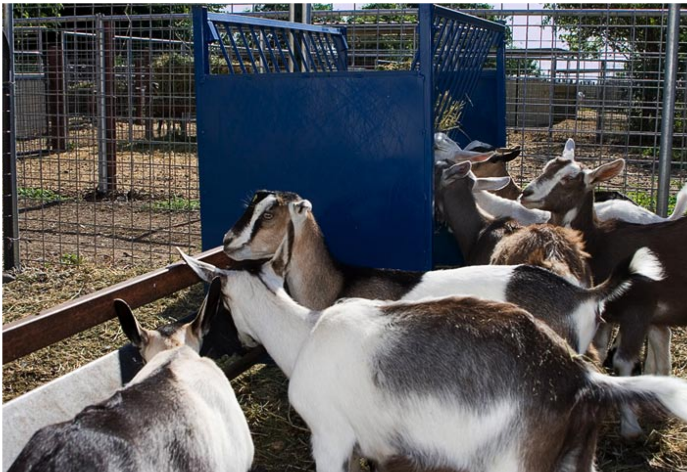
Kids using a hay rack (center) and a grain trough (left) at the UC Davis goat barn.

of age kids are offered small amounts of alfalfa. All producers in our survey offered their kids a grain-based concentrate along with hay or pasture. This is good for the kids, as a concentrate feed provides the added energy needed for the rapid growth that is a characteristic of this stage in the kids' lives. It also provides a balanced plane of nutrition at a stressful time in the kids' lives as they change from a liquid to solid diet.