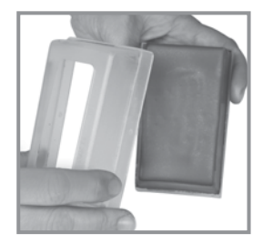
3. Turn holder back over and take the plastic cap off (protects crayon during transport).