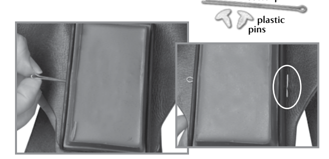
4. Metal Cotter Pin - Take the cotter pin and push all the way through the middle holes of the harness. Once the cotter pin is pushed through all the way bend back the ends flush with the crayon.