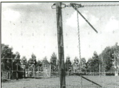
Multiple Clamp Strainers are used for deer fencing.

Hayes quality products are guaranteed against any defect in material or workmanship. Damage caused by abuse, improper use or excessive wear is not covered by this guarantee. Repair or replacement warranty claims could be referred to the place of purchase.