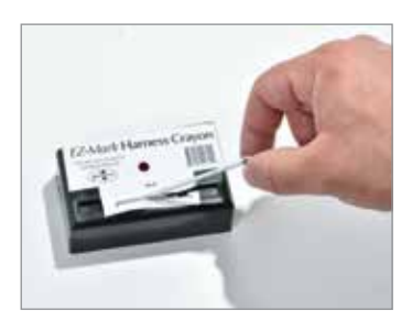
1. If using metal cotter pin, remove from the packaging. The plastic pins are provided loose.