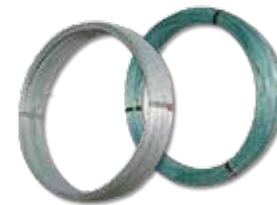
Q. Galvanized HT Smooth Wire R. GreenCote HT Smooth Wire