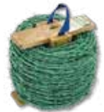
S. Barbed Wire