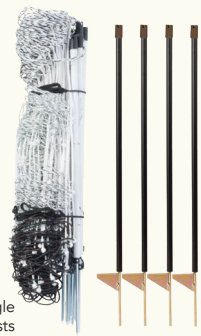
SS = Single Spike Posts