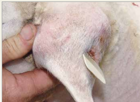
An infected ear.