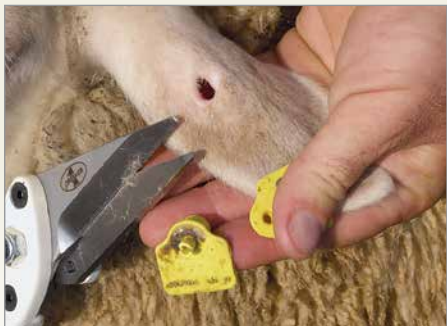
A good result.