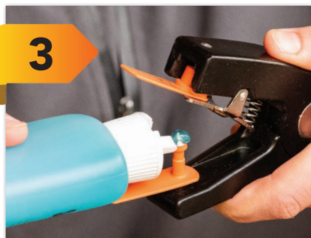
Apply SuperLube to ease insertion.