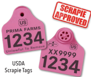
USDA Scrapie Tags