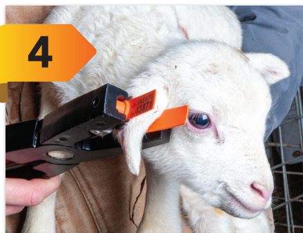
Place and insert tag near the center of the ear.