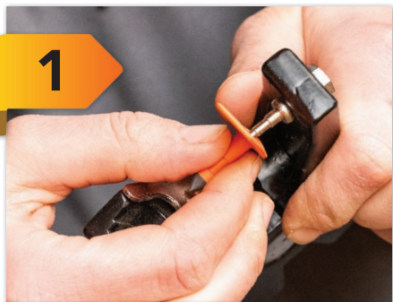
Insert the male side of the tag into the applicator.