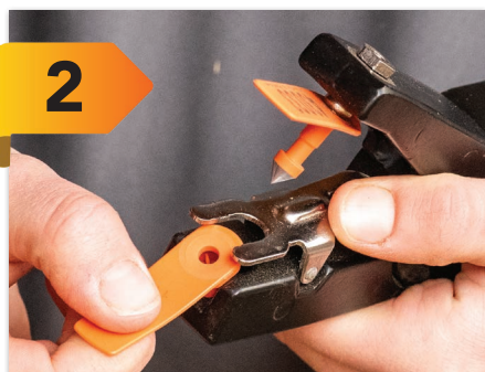
Insert the female side of the tag into jaw.