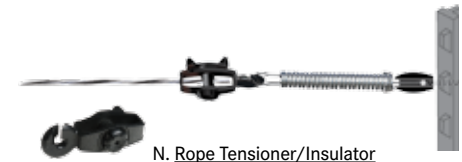
N. Rope Tensioner/Insulator