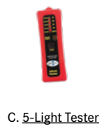
C. 5-Light Tester