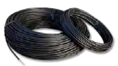
D. Insulated Cable