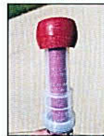
All three size Inflation fit into #2 Cylinder