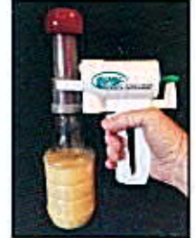
Shown with Large Cow Milker Inflation