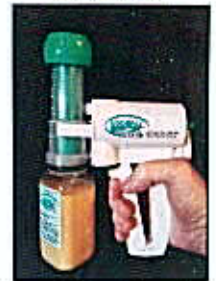
Shown with Sheep & Goat Silicone Inflation & Baz Domic