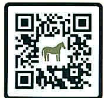
Equine Product Videos/Instructions

Visit our website for online live videos