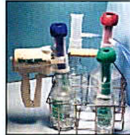
New updated parts for both Ez Milkers

Never use a microwave oven to thaw out frozen colostrum as it will destroy the antibodies. Place the colostrum bottle in a basin of warm water and allow to thaw slowly.