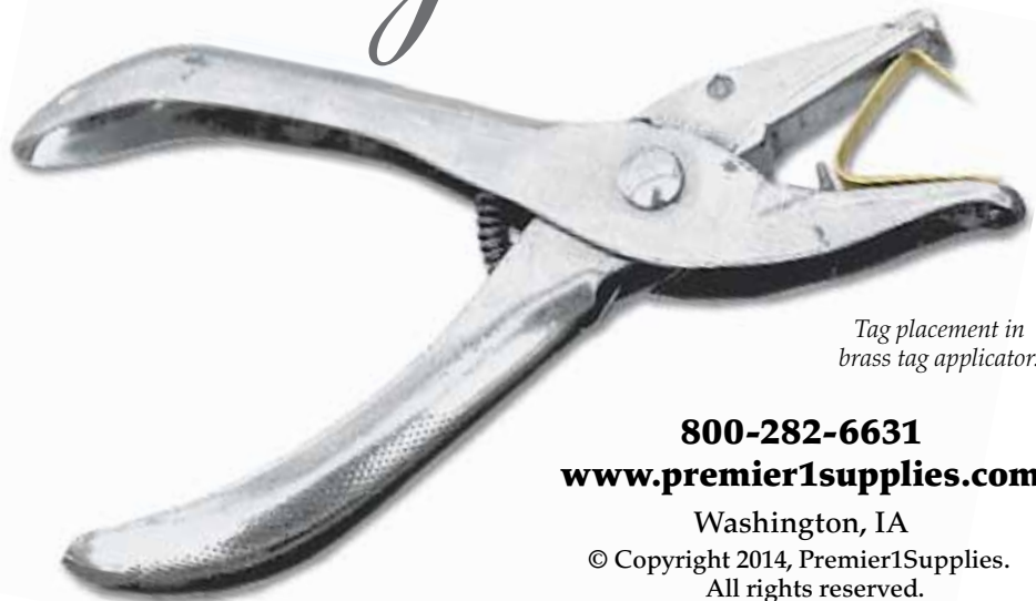
Tag placement in brass tag applicator.