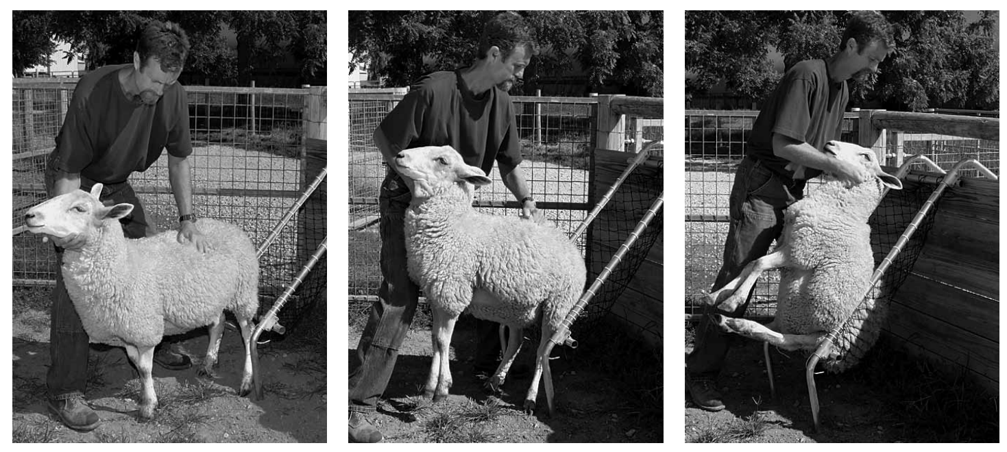
You neither need, nor should, lift sheep into a chair. Instead push it backwards by the neck/head until the butt end falls into the chair. Then lift up the head and tip it back into position. Using a small pen instead of a large one will make catching the sheep much easier. Also helps to have the chair near the corner of the pen.