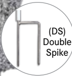
(DS) Double Spike