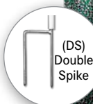
(DS) Double Spike