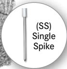
(SS) Single Spike