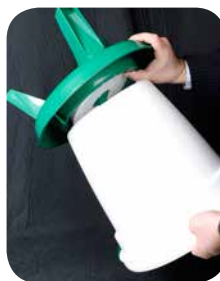
G) Flip bucket (3.) over so it rests on the green base (8.).