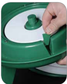
D) Press triangle valve (7.) (with the smooth side of the triangular piece facing the outside) into green base (8.).