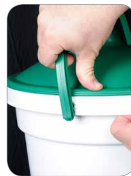
K) Take the plastic handle (11.) and snap both pieces into the slots on the bucket (3.). This will require reasonable pressure and force. There will be a definite "pop" sound when these have been properly installed.