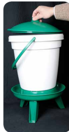
L) Fill with water and place the green cover (12.) on top of the bucket. Install by setting the waterer on level ground.