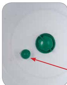
J) Take the green valve cover (10.) and firmly insert it onto the elevated plastic cone on the inside of the bucket.