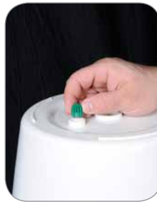
E) Place flow valve (4.), which includes rubber valve (5.) into base of white bucket. Flat rubber piece against the bucket.