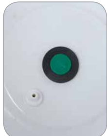
H) Place seal (2.) over the threaded bolt (1.).