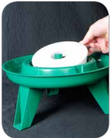
C) Set the large white plastic "diaphragm" (6.) onto the base of the bucket (8.). Place it so the larger diameter side is against the bucket.