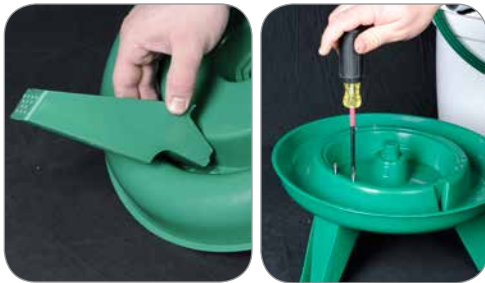
A) Screw legs into waterer base (8).