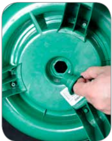
B) Insert threaded bolt (1.) through bottom of base.