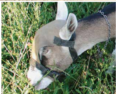
This nanny received a shield for exhibiting rude behavior.