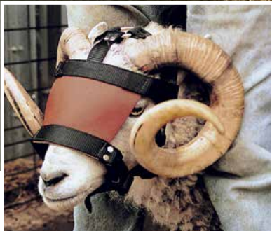
Shields should be checked often. Most rams will initially strive vigorously to remove the shield. (inset) Ram shields for horned rams use this design. Note how it is to be fitted.