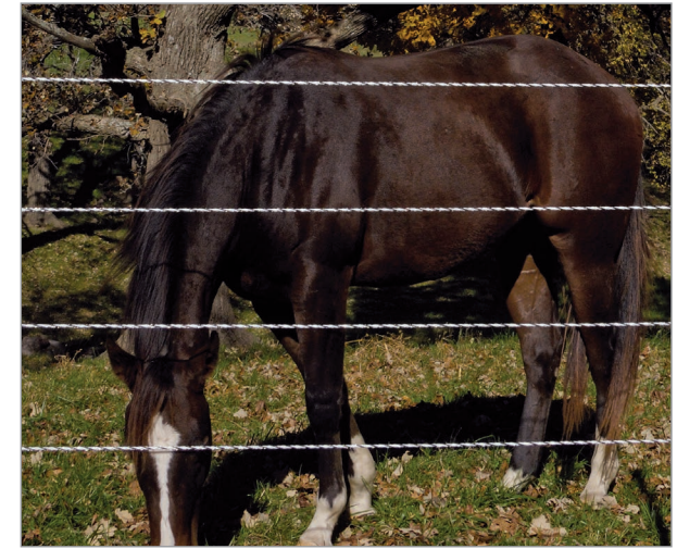
Illustrates the visibility of Premier's black/white ropes against different backgrounds.