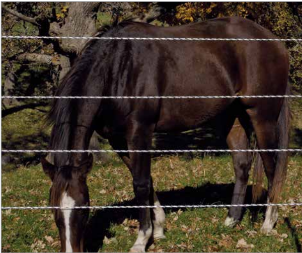
Illustrates the visibility of Premier's black/white ropes against different backgrounds.