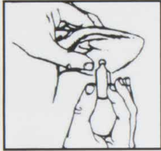
2. Feed long round end through hole.