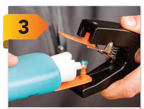
Apply SuperLube to ease insertion.