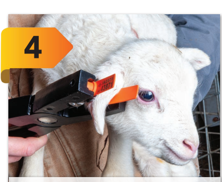
Place and insert tag near the center of the ear.