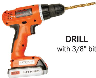
DRILL with 3/8" bit