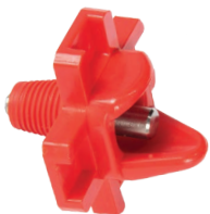
HORIZONTAL DRIP-CATCH NIPPLES