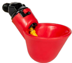
POULTRY DRINKING CUP