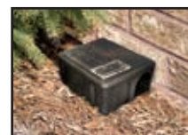
Exterior of Homes

All use must be consistent with the USE RESTRICTIONS in the DIRECTIONS FOR USE section of this label.