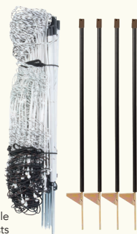
SS = Single Spike Posts